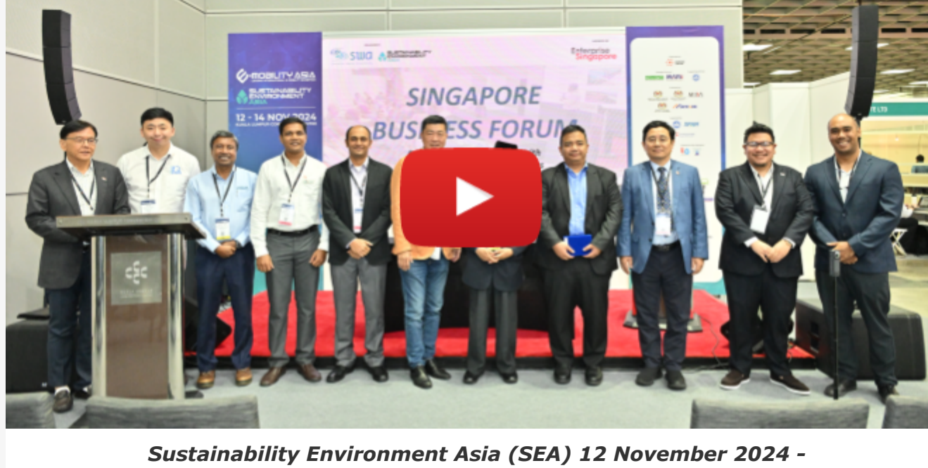
Sustainability Environment Asia (SEA) 12 November 2024 - Day 1 Show Highlights

Sustainability Environment Asia (SEA) 2024 opened at the Kuala Lumpur Convention Centre, gathering industry leaders, innovators, and sustainability advocates. The event kicked off with showcases and forums, all focused on advancing solutions in sustainability.