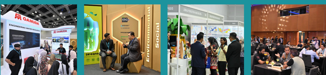
Exhibit at SEA 2026 to position your brand at the forefront of sustainability innovation in the region. Engage directly with industry leaders, policymakers and investors actively seeking practical, market-ready solutions. Unlock new partnerships, strengthen your brand presence and drive measurable business growth in the green economy.